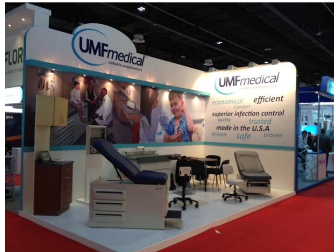
UMF Medical booth at Arab Health

assist in locating international museums, aquariums and interested buyers. Learn more about Treasures of the Earth at: http://www.universaltreasures.com/