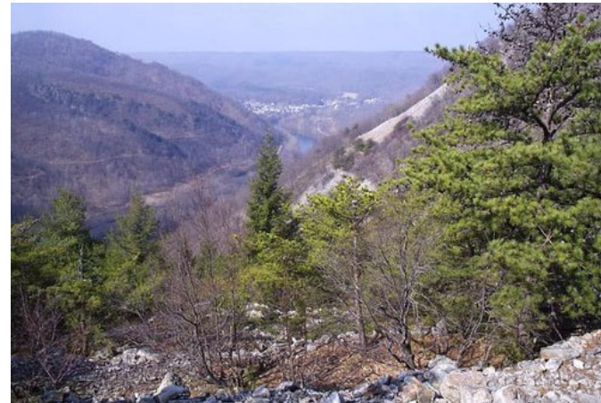
Figure 26: View of Jack's Mountain from the Link Trail

Jack's Mountain Greenway runs approximately 12 miles along the County's eastern border, extending to the Mifflin County line. This Corridor is intended principally as a conservation corridor without trail development.