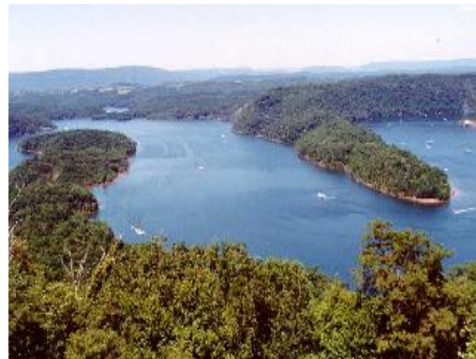
Figure 27: View of Raystown Lake

The Raystown Corridor East extends from Raystown Lake southeast to the Broad Top Greenway, a distance of approximately 10 miles. This recreation corridor is envisioned to contain a dirt trail.