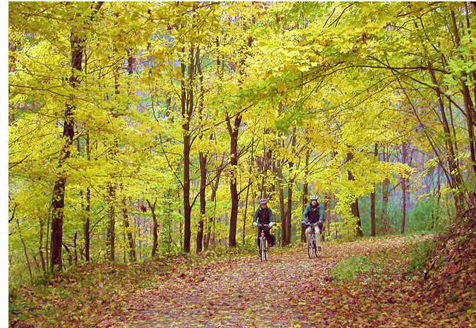
Figure 23: Segment of the Ghost Town Trail in Cambria County

Planned as a nearly 7 mile long preservation corridor that terminates at the Ghost Town Trail Connector. The preservation corridor is envisioned to be characterized by publicly accessible open space.