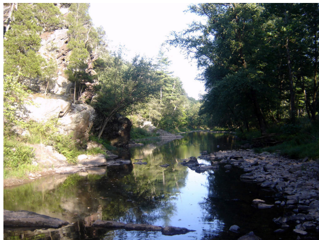
Figure 22: Sideling Hill Creek

This recreational corridor stretches through the southeastern portion of the County linking the Mid State Greenway, Buchanan State Forest and State Gameland #49. The approximately 8 mile corridor is envisioned to consist of a maintained dirt trail and is largely situated within either Buchanan State Forest or State Gameland #49.