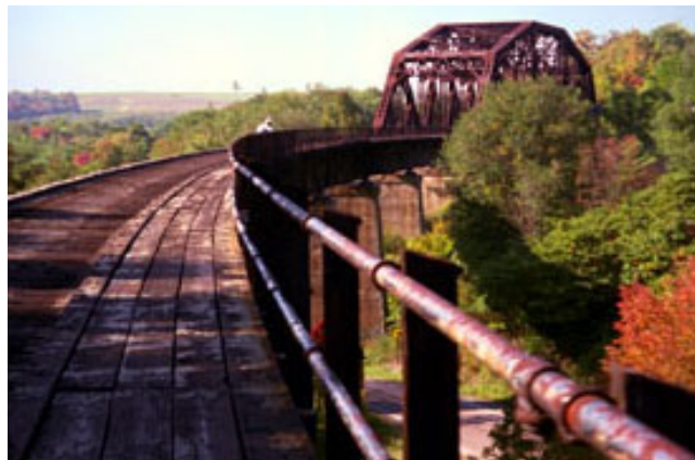
Figure 29: Great Allegheny Passage trail in Somerset County

The Cucumber Run Trail could be improved in the future as a maintained dirt trail for recreational purposes. The 5 mile long corridor links the Great Allegheny Passage with the Whites Creek Valley Trail. Most of the length of the corridor is situated within State Gameland #27.