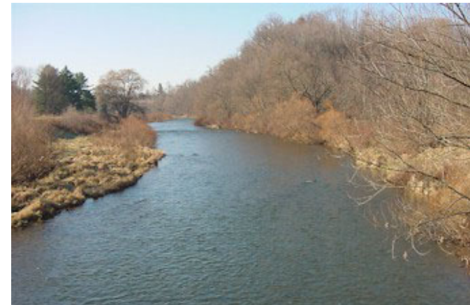
Figure 30: View of the Casselman River in Somerset County

river trail. The nearly 6.5 mile long corridor connects Salisbury to the Great Allegheny Passage.