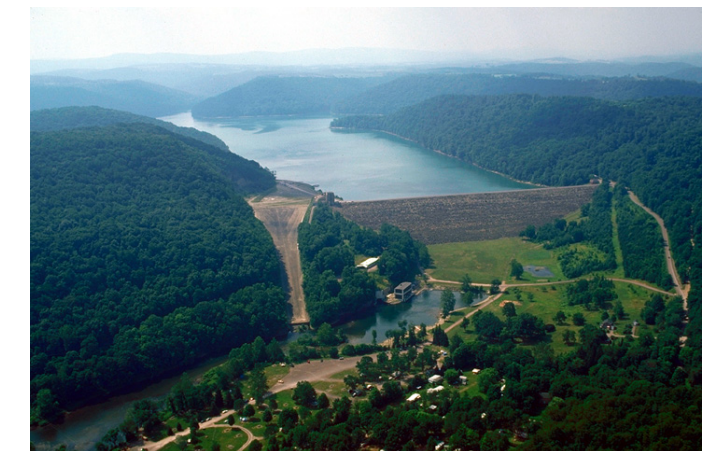
Figure 28: Youghiogheny River Lake

The Youghiogheny River Lake Trail extends approximately 8 miles from the Great Allegheny Passage (near Confluence, PA) to the County's southern border. An improved/maintained dirt trail is envisioned to someday be connected with the corridor.