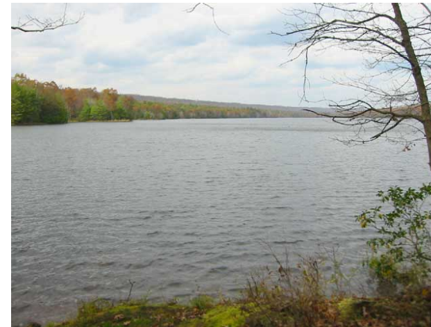
Figure 25: Meadow Grounds Lake

Most of the corridor is situated within State Gameland #53 and is near Meadow Grounds Lake.