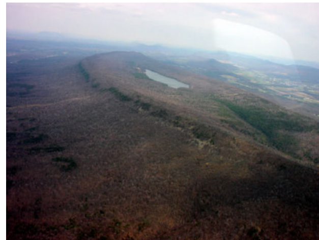
Figure 24: Aerial of Meadow Grounds Lake

The Little Scrub Ridge Wildlife Corridor is envisioned to be an open space corridor which runs within the eastern portion of Fulton County linking the Tuscarora Trail to the Allegheny Crossing. The nearly 25 mile corridor passes through State Gameland #53 and 124 and accesses Meadow Grounds Lake.